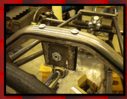
THE PLATE THAT WAS CREATED to hold the starter button

create a mount for the throttle cable. This was done by taking a small piece of steel with a hole drilled in it and welding it to the chassis of our car. These final pieces completed our chassis.