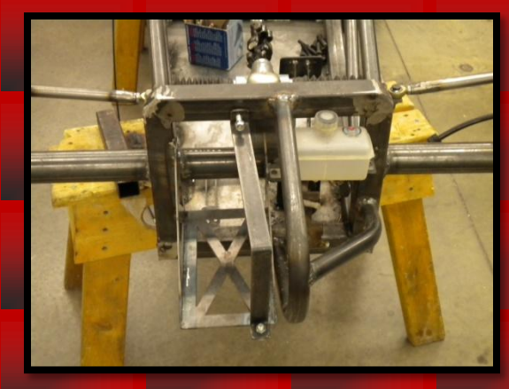
THE BATTERY MOUNT WE Designed fo<mark>r our c</mark>ar

to cut off the extra length on both sides and then grind the axle's ends by hand back to the 5 degrees needed. This mistake set us back 3-4 days. We then had the spindles pressed into the mounts and had the mounts welded to the front axle. After the axle was mounted to the chassis we had to build our battery box on the front of the chassis. We had the battery mount plates cut out at NWTC on the water jet. The battery mount was welded to the chassis and then we moved on to work on the pedals. Our pedal designs were also cut out on the water jet at NWTC. Once the pieces of the pedals were made we welded them together. Then we made small pieces of metal and welded them to the pedals to keep