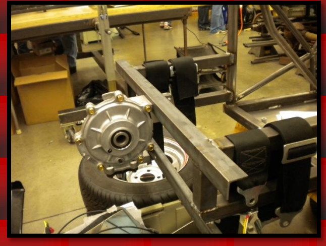
THE DIFFERENTIAL ONCE IT Was installed on the back of the chassis

Once we received our rear differential from Hilliard we were faced with the challenge of attaching it to the back end and then aligning it with the motor so the chain can be attached. We decided to attach the differential by drilling holes in the back bar and then attaching the differential with bolts. One problem that we had to deal with was finding a way to bolt the bottom side of the differential the chassis. There was an inch gap that would allow the differential to move around and not be secure. We solved this problem by fitting two spacers,