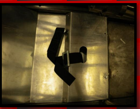
THE BOTTOM OF THE SEAT Where we had to cut a hole for the strap of the 5-point safety harnes<mark>s to</mark> come through.